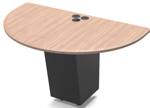
Code 526HR 526HR (Huddle Room section)